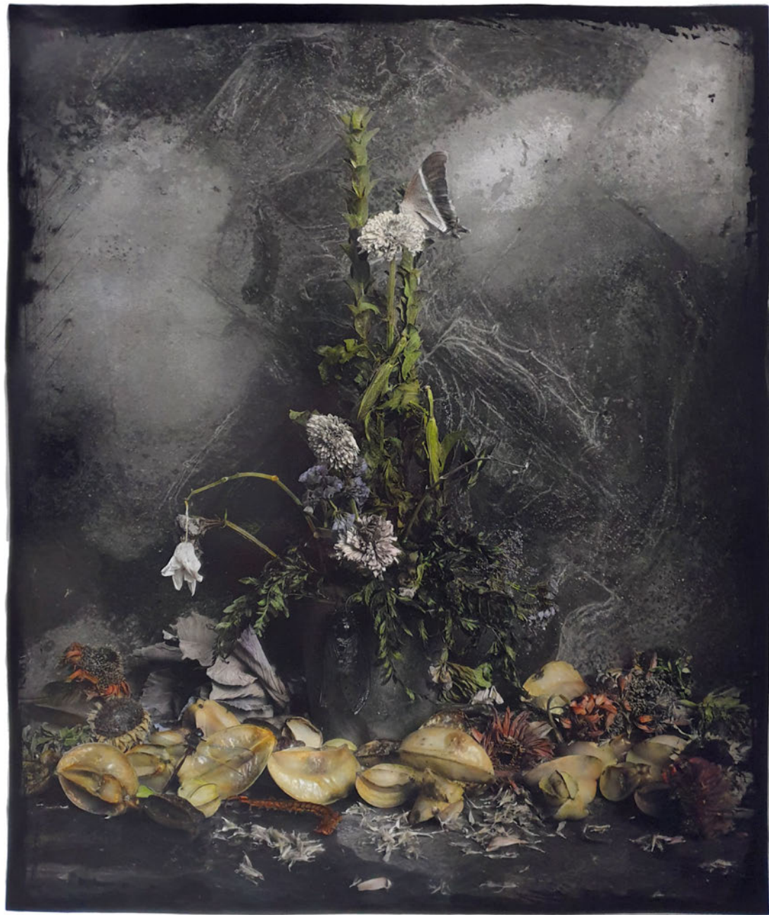
FIN 2022 93cm x 76cm, Hand painted silver gelatin print on warm tone gloss fibre, Edition 5